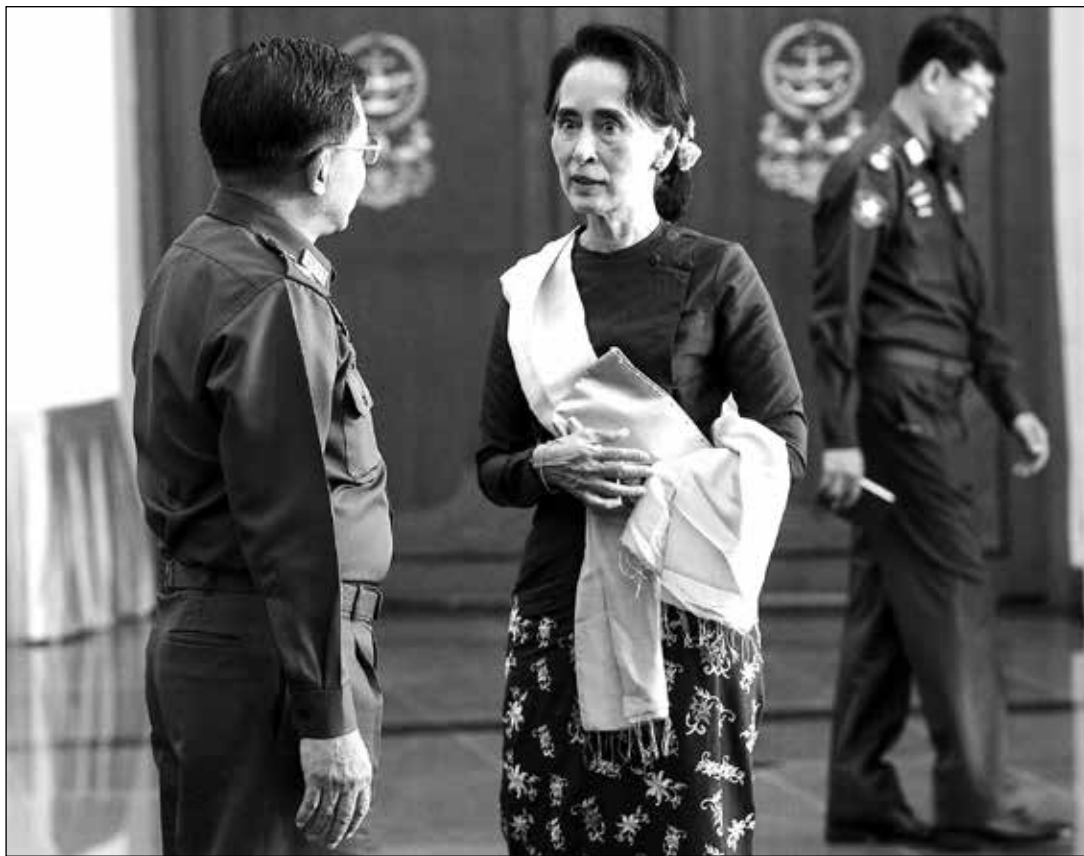
Myanmar Commander-in-Chief Min Aung Hlaing and NLD leader Aung San Suu Kyi. The NLD, whether fairly or not, will be judged on its ability to manage a government that it does not fully control.

A less likely possibility is that the NLD will respond to public dissatisfaction and attempt to engage in rapid reforms or mobilise support to reform the Constitution. This high-risk approach carries the danger of panick-